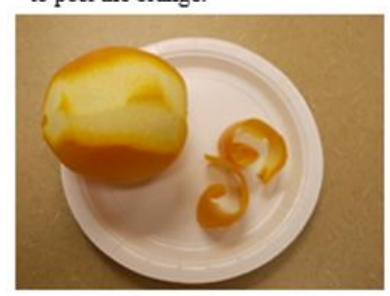
Did she peel the orange?

Neutral Goal Context: Jesse wants to peel the orange.